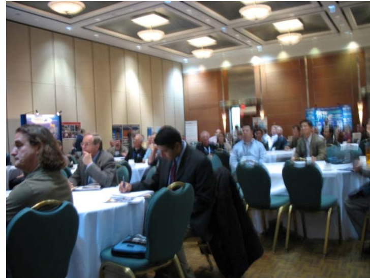
Continued on Page 9